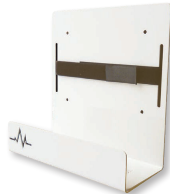
0460-0028 AED Wall Sleeve