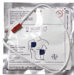
G5 Adult Intellisense Electrodes (no CPR feedback) 0511-9131