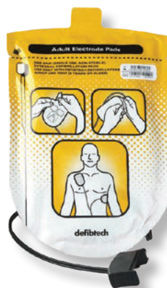
Lifeline Adult Pads 0710-0130