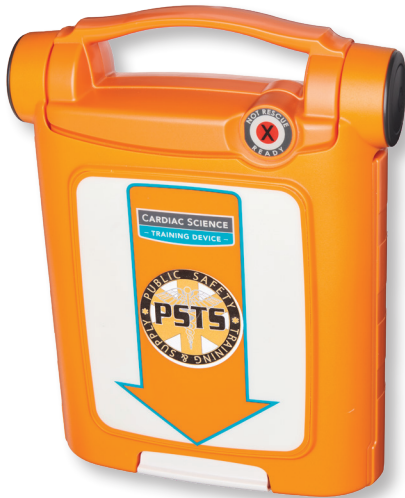
G5-T Training Device 0511-1740