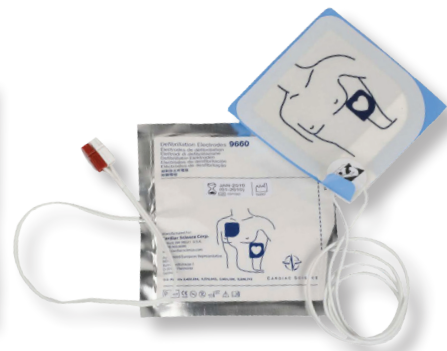
G5 Pro Polarized Electrodes 0511-9660