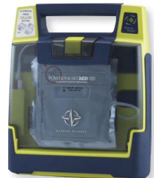
G3 Plus AED