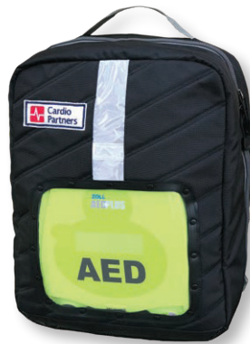
0460-10422 AED Backpack