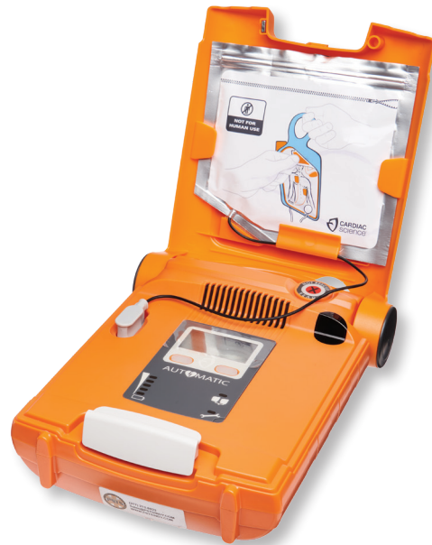
G5-T Training Device 0511-1748