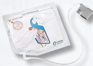
G5 Pedi Pads 0511-0022