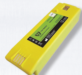
G3 Battery 0511-9146