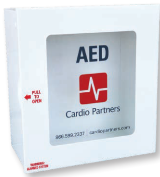
0460-0050 AED Surface Mount Cabinet with Alarm

Our AED wall storage cabinets come in various sizes to fit your facility's needs. Cabinets are available as surface mounts (most common), semi-recessed and fully-recessed. Add an alarm, an alarm with strobe, or no alarm at all. The choice is yours. We also have Stainless Steel wall cabinets available. Call PSTS for assistance with special cabinet orders!