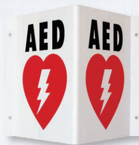
0460-0016 3-Way Triangular Sign