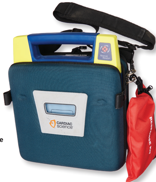
G3-T Training Device 0511-1742