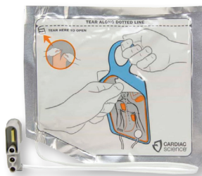
G5 Adult Intellisense Electrodes (no CPR feedback) 0511-0023