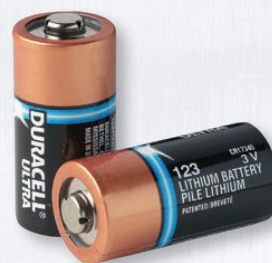
AED Plus Lithium Batteries 0660-6003