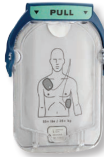
G5 Adult ICPR Feedback Electrodes 0511-0027

Using the HeartStart OnSite Defibrillator is simple. Pulling the green handle powers-up the defibrillator and activates voice instructions. These instructions are paced to your actions, to help guide you through the entire process, from placing pads on the patient to delivering a defibrillation shock. HeartStart OnSite determines if a shock is needed, based on its automated assessment of the victim's heart rhythm.