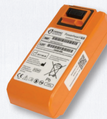
G5 Battery 0511-0024