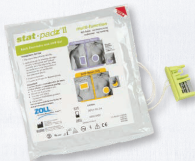
Adult Stat Pads II 0970-0520