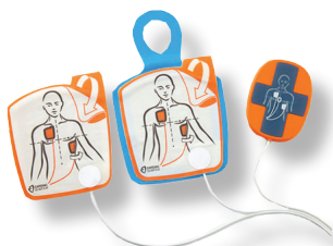
G5 Adult ICPR Feedback Electrodes 0511-0027