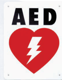
0460-0019 Flat Wall Sign